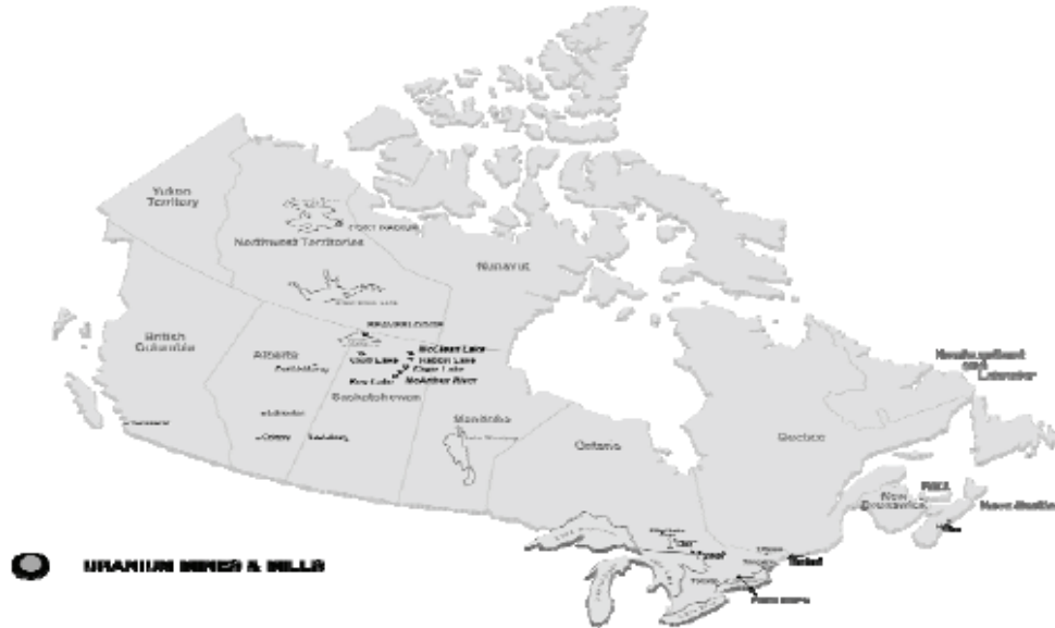
Figure 1 - Location of uranium mine, mills and processing facilities in Canada

The CNSC’s commitment to dissemination of objective scientific and regulatory information and to advancing the scientific understanding of the potential health effects of uranium mining, refining and processing will position us well to meet societal expectations during this time of uranium industry growth.